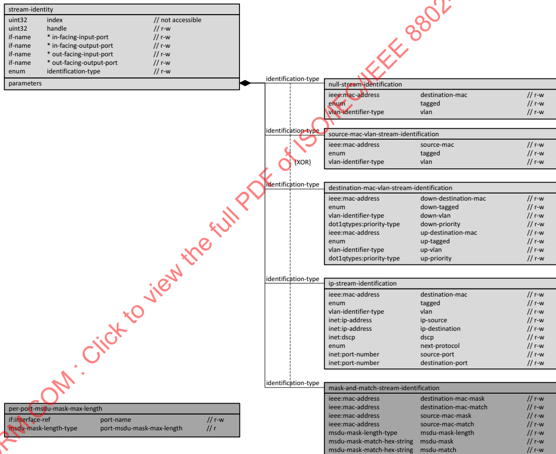
Figure 12-3—Stream identification model

Replace Figure 12-3 with the following figure (with darker-grey background boxes added):